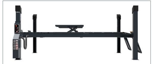
Wheel-free jack (load capacity 3.5 t) with wheel alignment kit